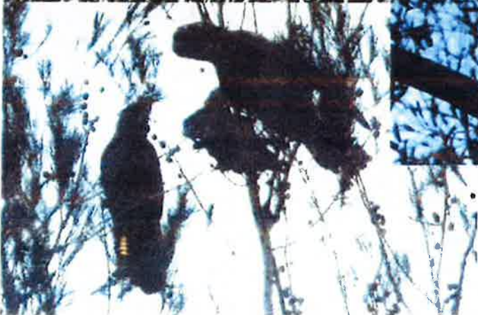
THIS IS CAMPBELLTOWN